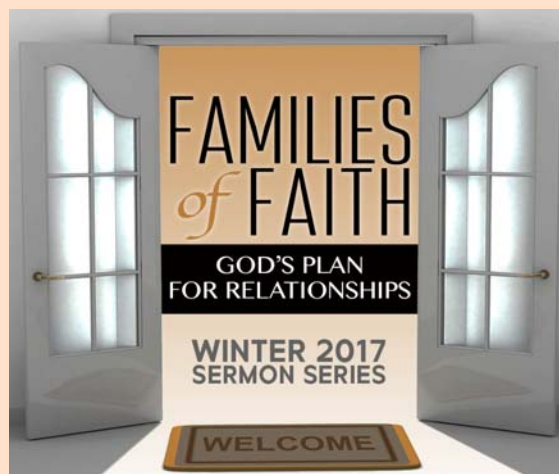
Families of Faith - God’s Plan for Relationships

Encounter Service, 8:15 Cornerstone Service, 10:30