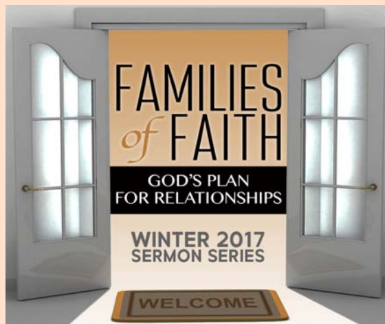
Families of Faith - God's Plan for Relationships

Encounter Service, 8:15 Cornerstone Service, 10:30